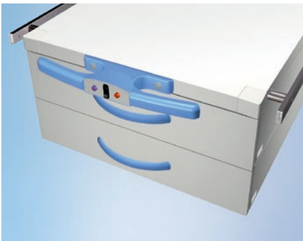
Medium-load shelf, maximum of two drawers, with optional control handle