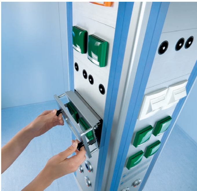
Conversion of a supply module for electricity