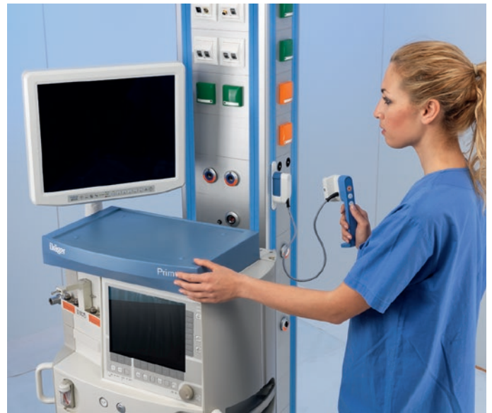
Ease of use thanks to remote control of MPC Rail – for raising the anaesthesia device and operating the brake