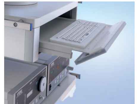
The heavy-load shelf with keyboard drawer makes it easy to document in the room; its handle-free design also makes it easy to clean