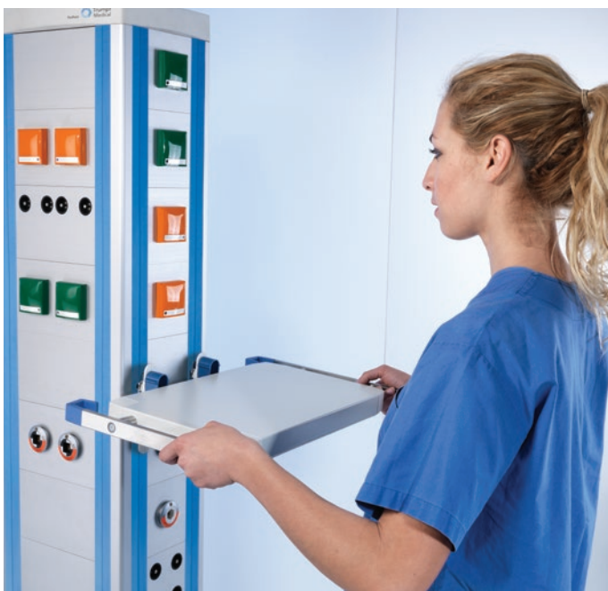
A click mechanism provides for straightforward, tool-free fixing of workstation components such as shelves on every side and at all heights of the support head

Every TruPort support head can be equipped with different supply modules required, from gas to electricity and data. Trained personnel can make additions or changes easily without the need for common tools, even after initial installation.