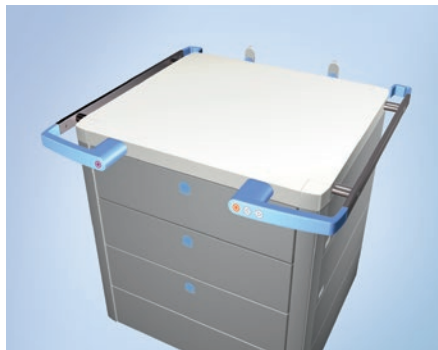
Heavy-load shelf, maximum of four drawers, with optional control handle