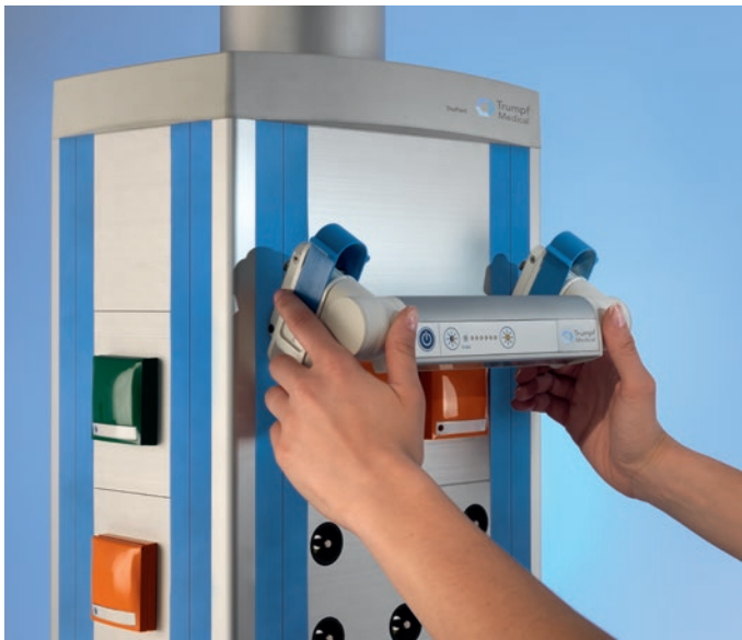
Click mechanism for comfortable, tool-free insertion of pivoting LED lamp

Special electronic workstation components can be attached to the optional MPC Rail which uses low voltage power. Function commands are forwarded via a BUS system, providing for new possibilities for workstations that are more innovative and ergonomic than ever before.